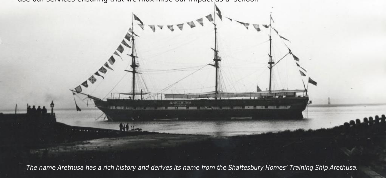
The name Arethusa has a rich history and derives its name from the Shaftesbury Homes' Training Ship Arethusa.

We believe that it is Jesus' desire to be a part of everyone's life. Through His example, we see that those on the margins are loved and fully accepted by God. The life of Jesus motivates us to serve others, pursue justice and demonstrate His love, freely given to all. While society often discriminates against people due to disability or social circumstances, Arethusa College values the unique worth of all individuals and works to give people dignity, opportunities and choices to fulfil their God given potential. We aim to deliver services of the highest quality. We work closely with a range of regulatory and advisory bodies to ensure that we promote and retain this excellent service. Arethusa College has a commitment to a high level of professionalism. Our staff are dedicated to those who use our services ensuring that we maximise our impact as a school.