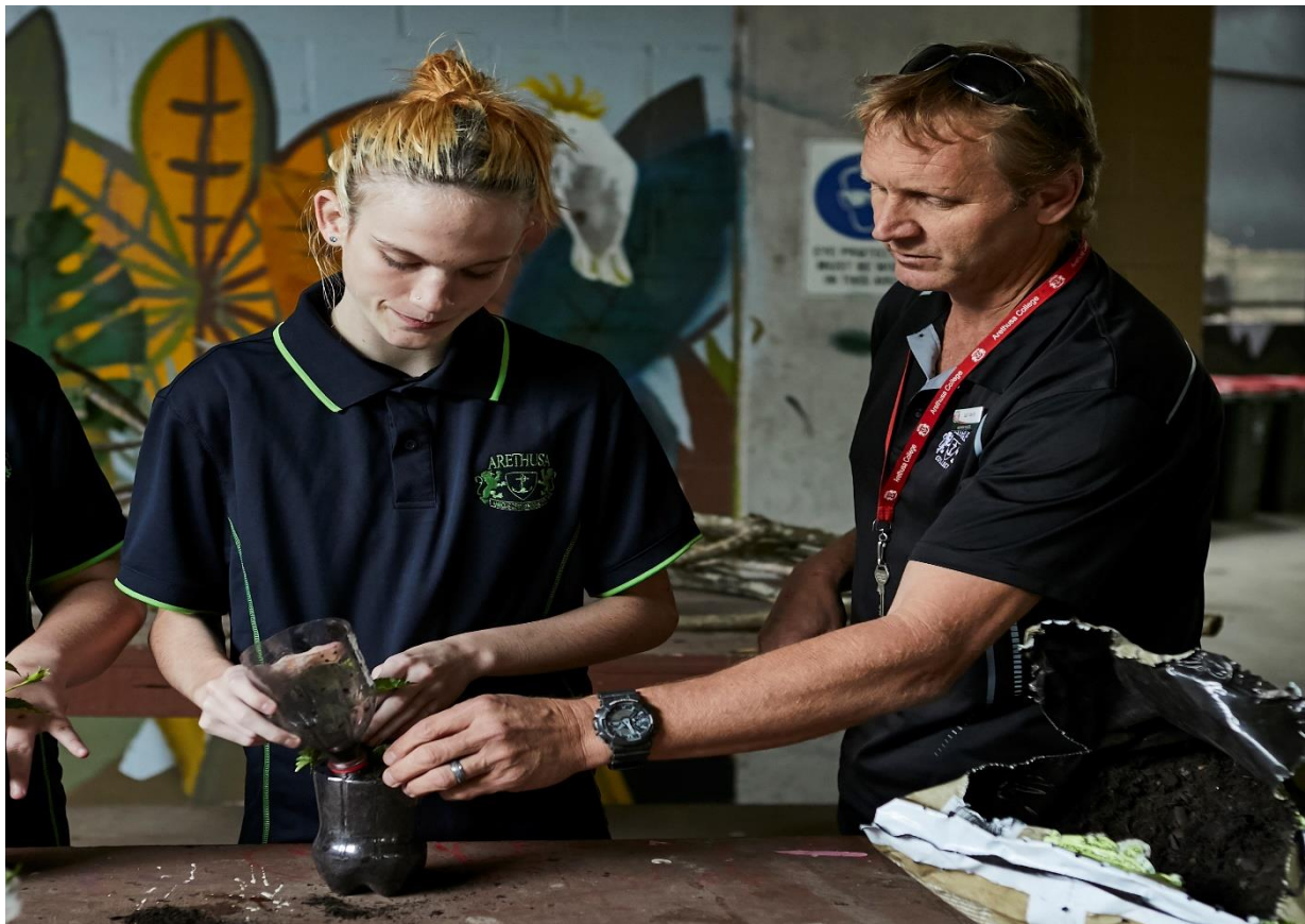
Below: Students working on plants for the Agricultural Practices subject