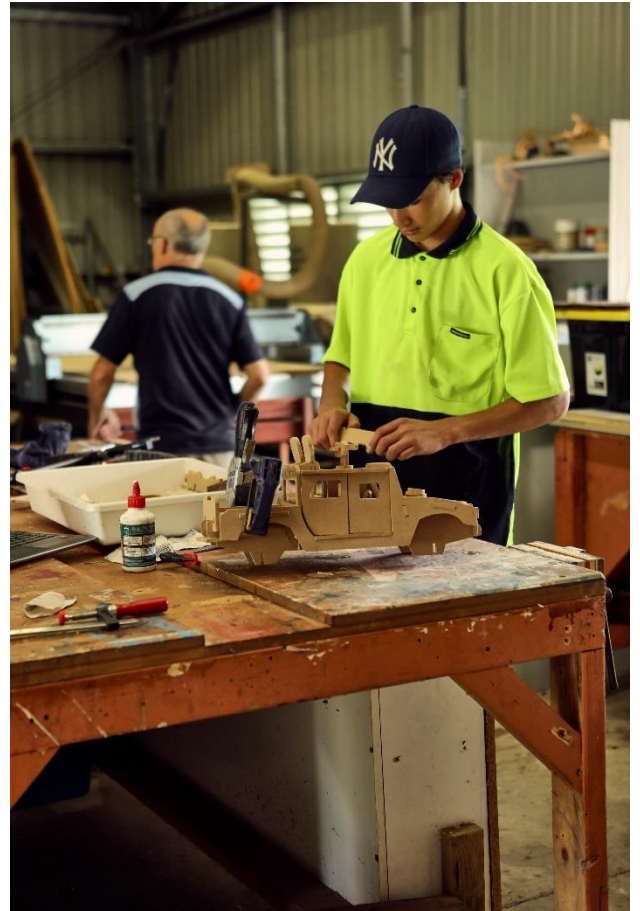
Right: A Deception Bay student in the wood working classroom