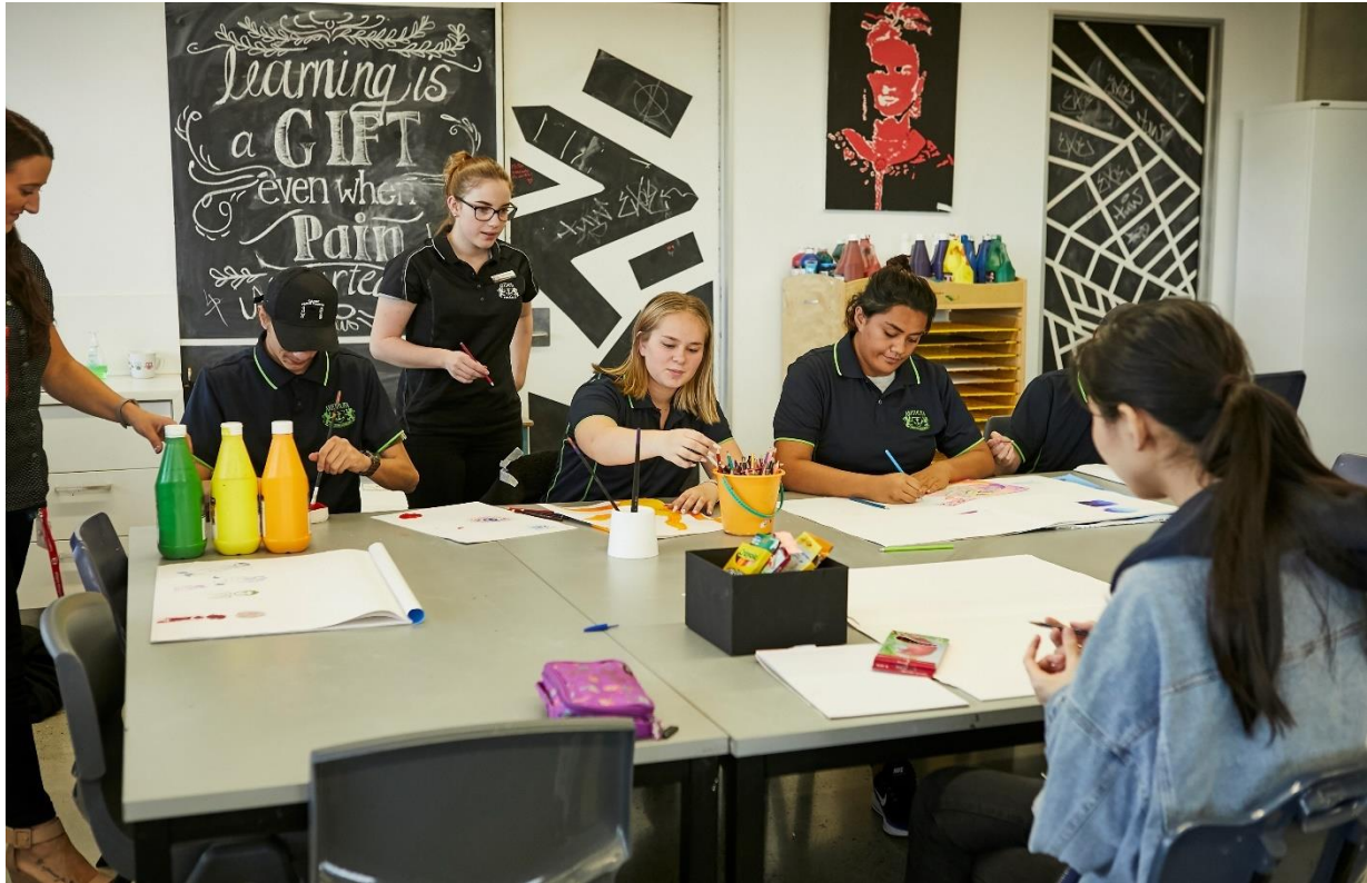
Above: The art space at our Spring Hill campus

School income broken down by funding source can be found on the My School website at www.myschool.edu.au