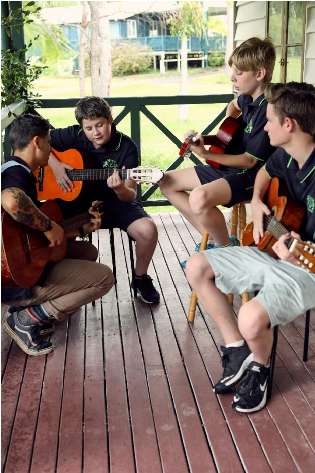
Left: One of the staff teaching the students to play the guitar