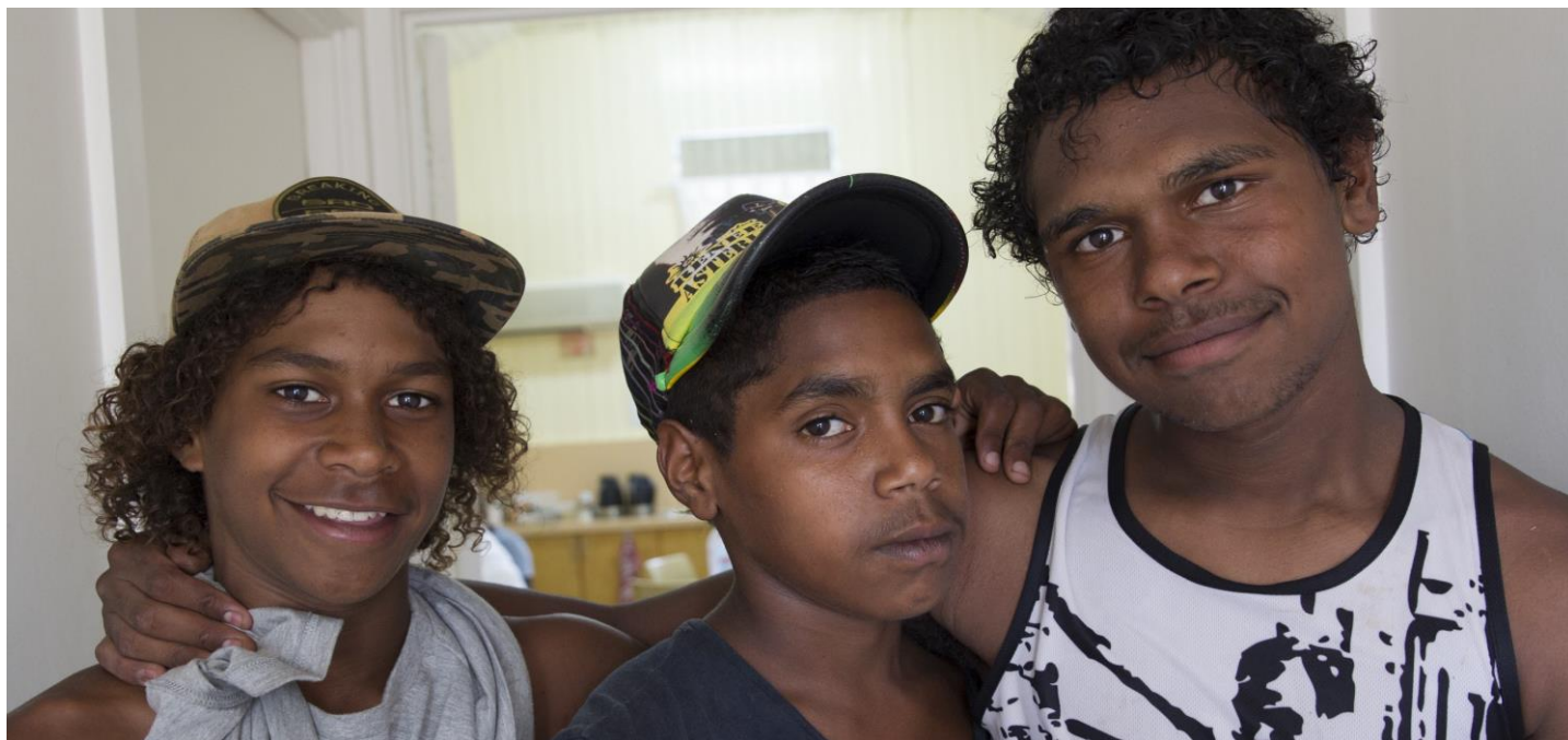
Students from the Barambah Creek Campus.