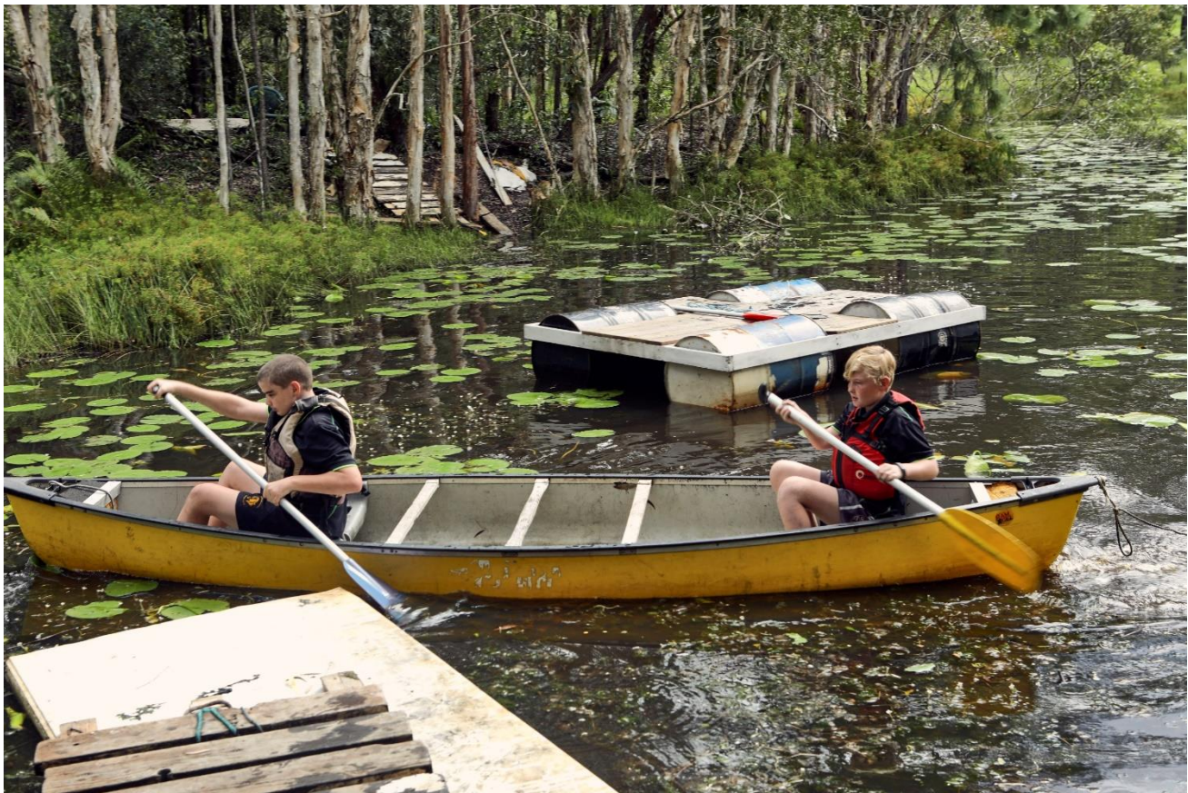
Students learning canoeing skills at the Deception Bay Outdoor Education classroom

The College implements the processes of Restorative Conferences for addressing issues of behaviour management (such as harassment or bullying). This approach provides a voice to victims, and encourages open and honest communication about the situation, the impact on all parties, and provides all parties with a clear plan for going forward. Students are held accountable for their behaviour and the impact their behaviour has had on everyone involved.